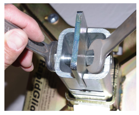
Insert bolt through one side of plate and install nut – then tighten.