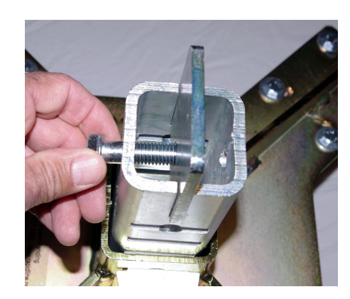
Slide \frac{1}{4} " plate into tube slot making sure it is seated at bottom and bolt holes are lined up.