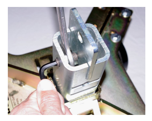
Slide ¼" plate into tube slot making sure it is seated at bottom.